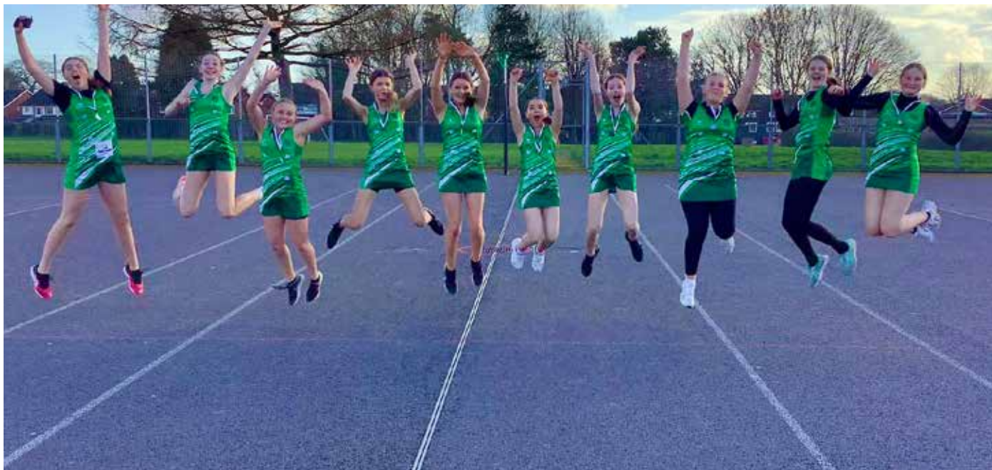
These Wellsway School netballers are jumping for joy after making it to the West of England finals at SGS College

It's exactly four years since we had to shut our doors to many pupils to try to help prevent the spread of coronavirus. The pandemic certainly brought many challenges, and in some cases tragedies. Recent research shows that many people of all ages are still suffering from Covid's after-effects and will continue to do so for some time. Yet we learned from the lockdowns too, building on our strengths and developing some new ways of working that will help us in the years to come.