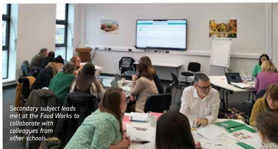
Secondary subject leads met at the Food Works to collaborate with colleagues from other schools.

Feedback from participants was extremely positive. Some appreciated learning new strategies to implement in their school: 'Incredibly useful and inspiring training! Ingrid has shown us many different ways we can implement